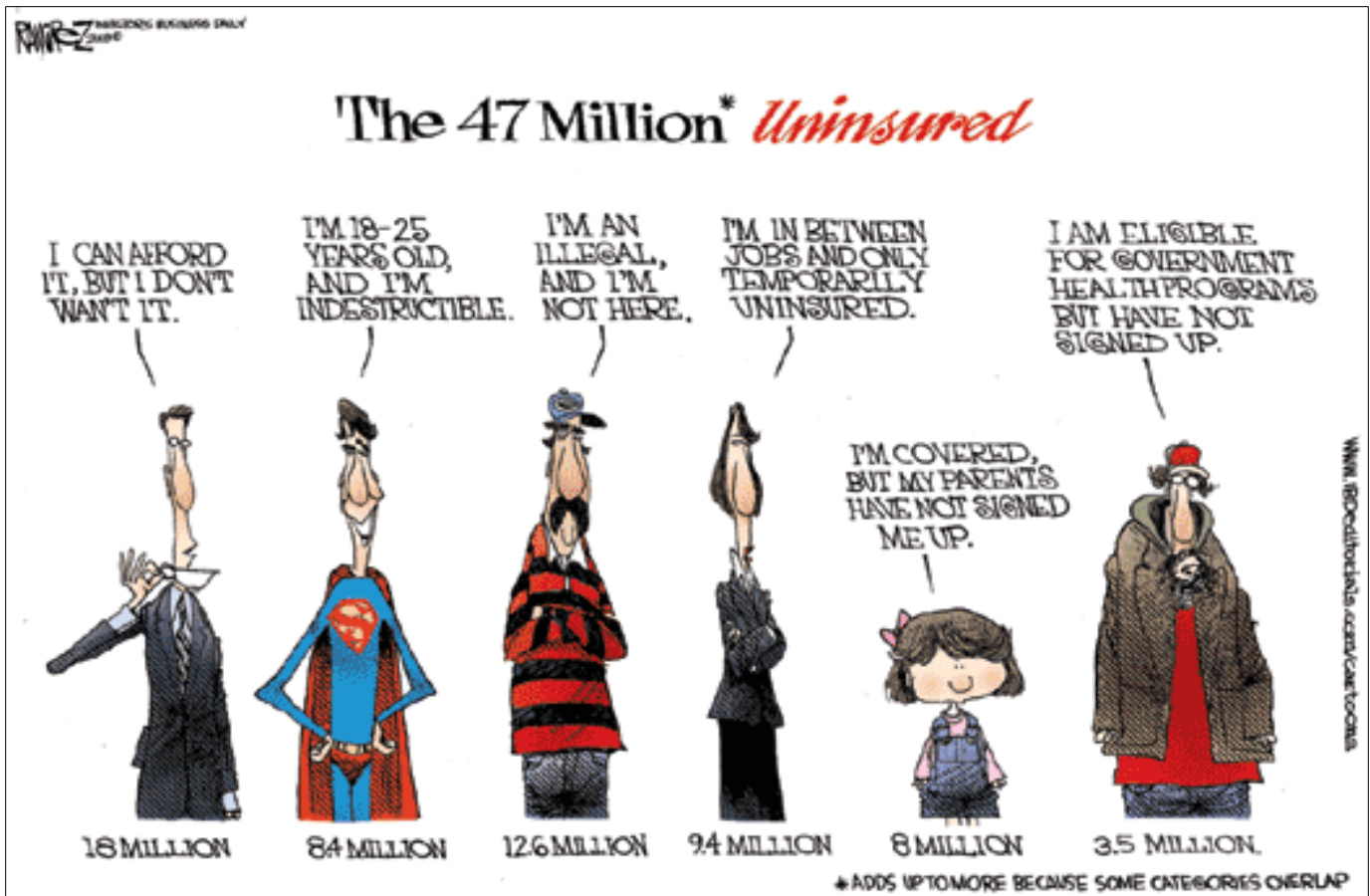
Originally published July 24, 2009 in Investor's Business Daily .

Among Independent voters, 57 percent would oppose such a Senator, and only 17 percent would support. Forty-nine percent of young voters (age 18-29) would oppose a Senator who votes to confirm a nominee who does not believe Second Amendment rights apply to all Americans, and just 31 percent would support such a Senator. A plurality of Hispanic voters (42 percent) would oppose such a Senator, and only 28 percent would support. A large percentage of Hispanics (30 percent) are not sure. A majority of union members (54 percent) would also oppose, and 29 percent would support. ###