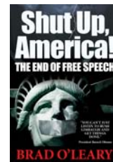
Shut Up, America! The End of Free Speech